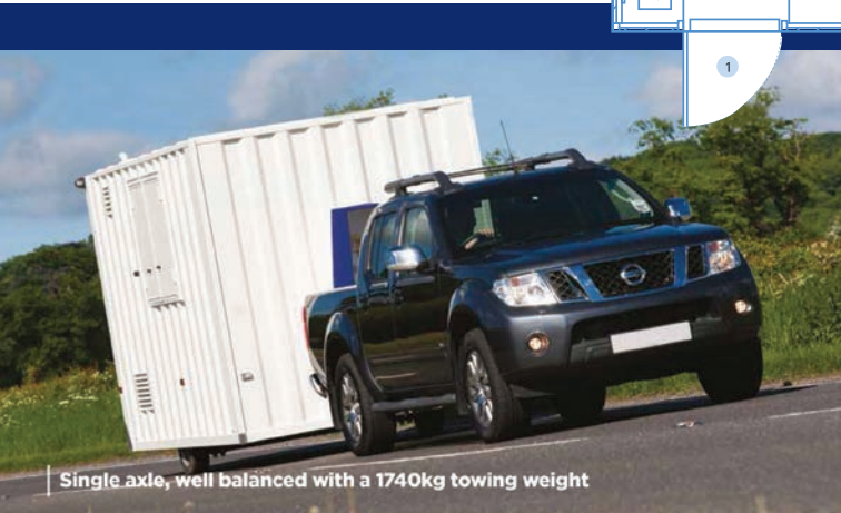
Single axle, well balanced with a 1740kg towing weight